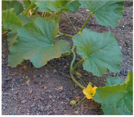
Top and bottom: Vegetables in the TBE Garden.